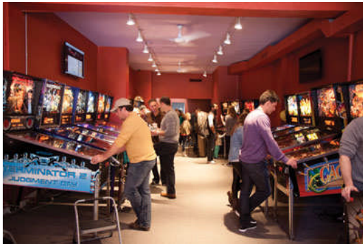
PHOTO: Modern Pinball showroom floor will feature 30 to 35 games at a time. Games can be purchased or leased for a few years.