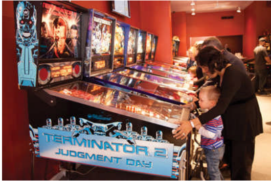
PHOTO: Kids and their parents crowd Modern Pinball NYC to play brand-new and classic flipper games. All games in the retail showroom are set on free play, and visitors can pay one price to play all of them.

and playing pinball machines. It will also serve as headquarters for the International Flipper Pinball Association.